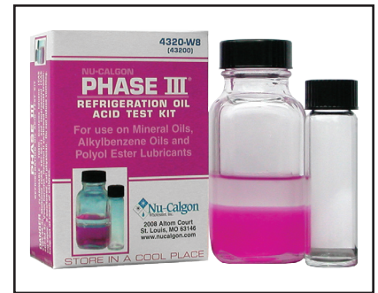
PART NUMBER 4320-W8

In addressing this situation, the technician's refrigeration oil acid test kit has become indispensable and Nu-Calgon's Phase III® Refrigeration Oil Acid Test Kit is the most reliable test kit available.