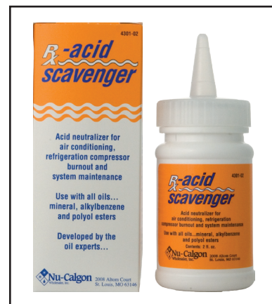
PART NUMBER 4301-02

Rx-Acid Scavenger™ was developed to specifically “scavenge” and neutralize such acids. Based upon newer carbimide chemistry, it allows for use with all oils: mineral, alkylbenzenes and POE. Less is required per gallon of system oil as compared to current market competitors.